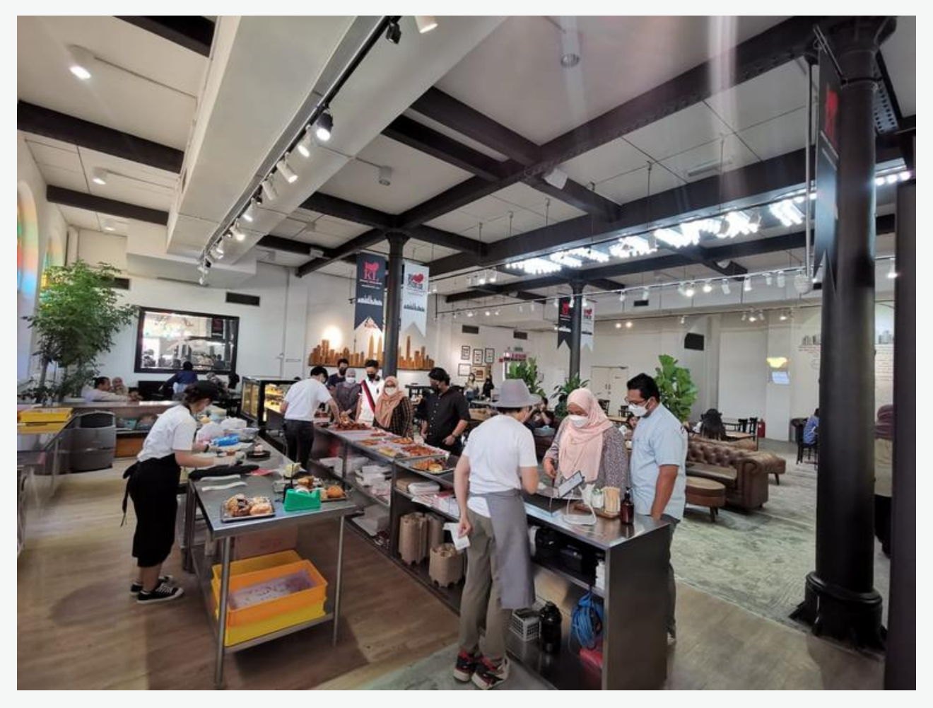
During the multiple lockdowns in 2020 and 2021, the Kuala Lumpur City Gallery team moved online to sell baked goods, before upgrading the gallery to include a fine confectionery and bakery cafe to entice more local visitors. – Pic courtesy of Andrew Lee, January 5, 2022