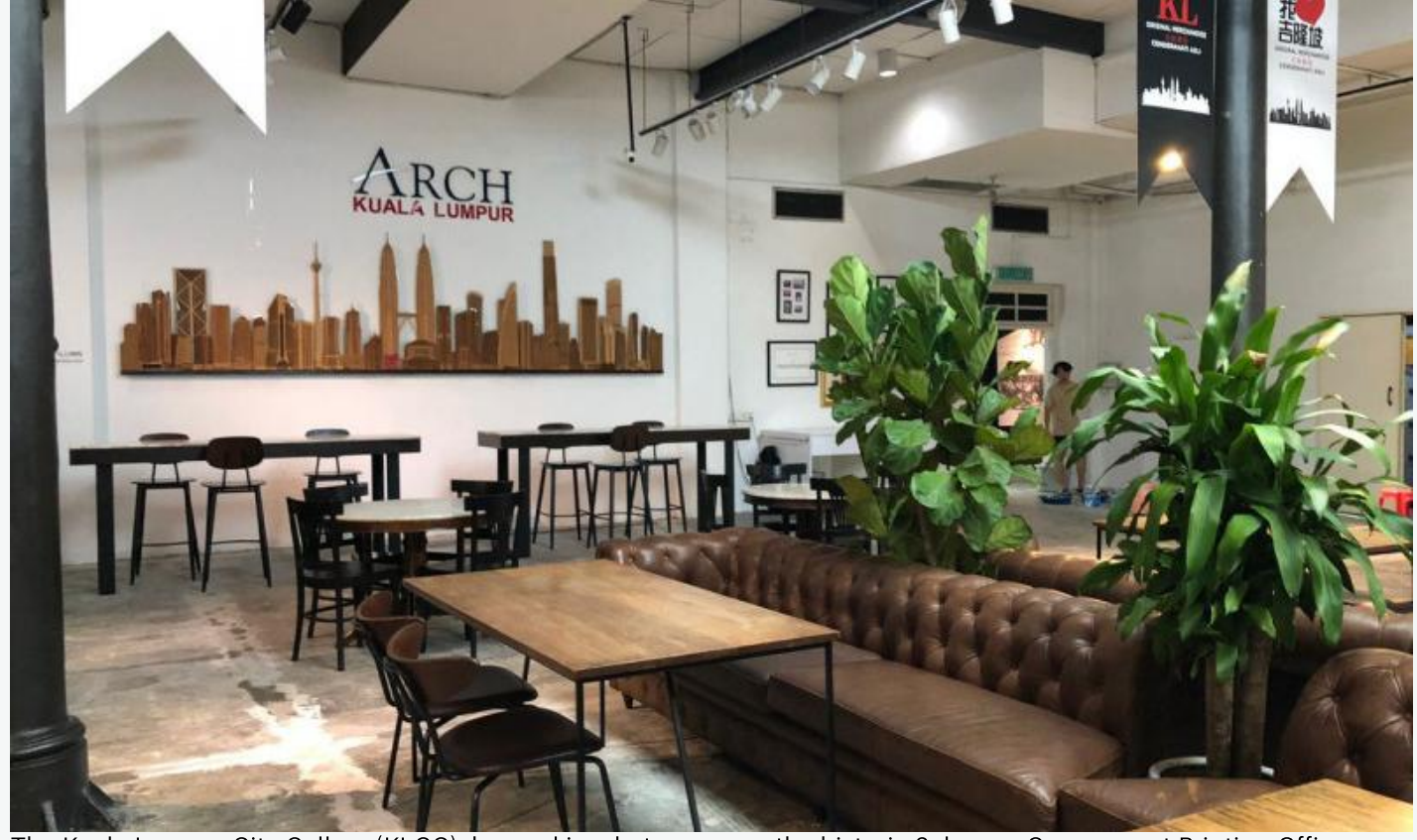
The Kuala Lumpur City Gallery (KLCG), housed in what was once the historic Selangor Government Printing Office building, is a tourist information centre of the city and serves as a sort of museum where visitors can learn about Kuala Lumpur's past, present and future.