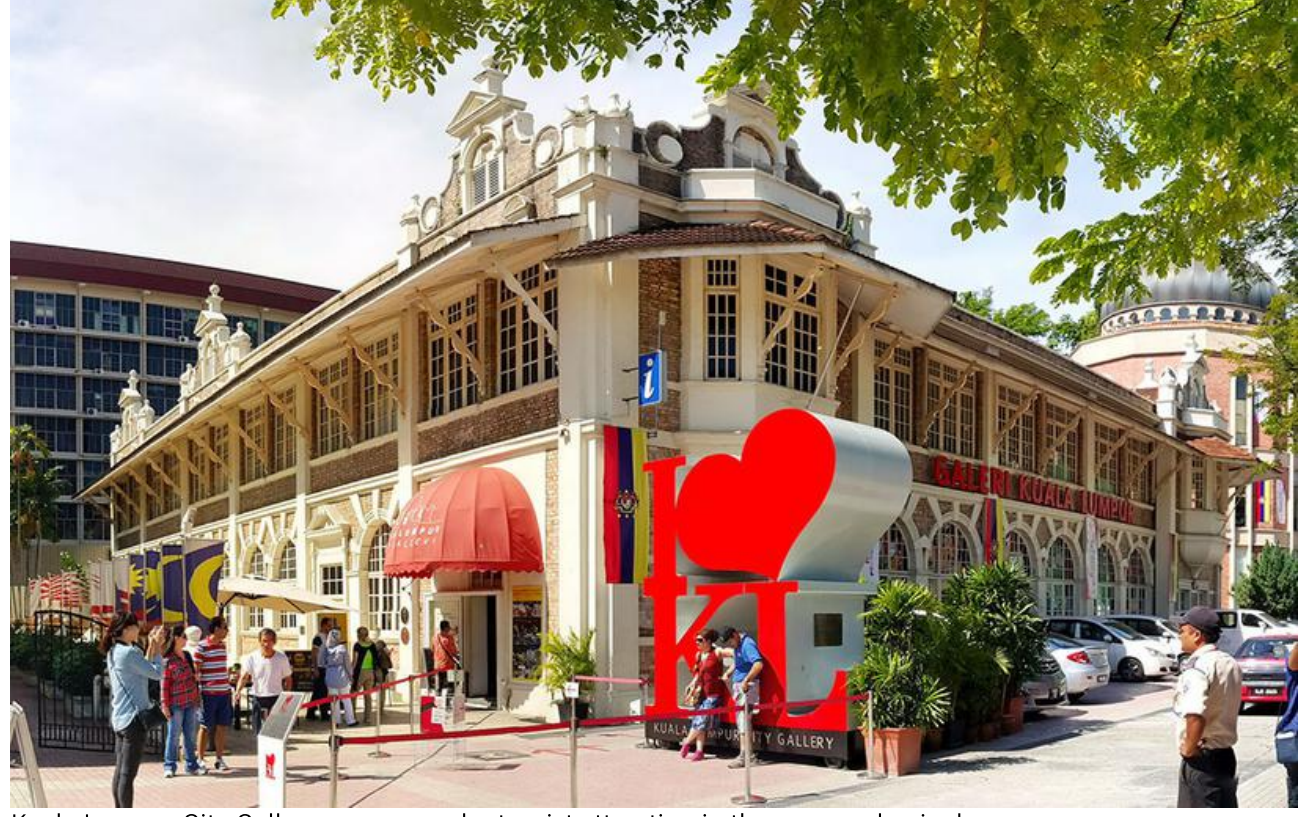
Kuala Lumpur City Gallery was a popular tourist attraction in the pre-pandemic days.